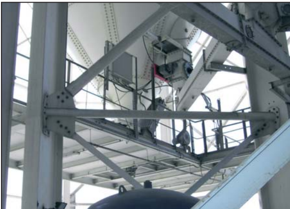
▲ Feeding of the packing machine by frequency controlled air slide systems.