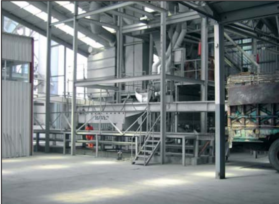
Front view of the Haver & Boecker ► packing machine with platform for empty bags.

◀ The cement will be packed with a Haver & Boecker 4-spout-in-line-packing-machine, capacity 1200 bags/50 kg/h.