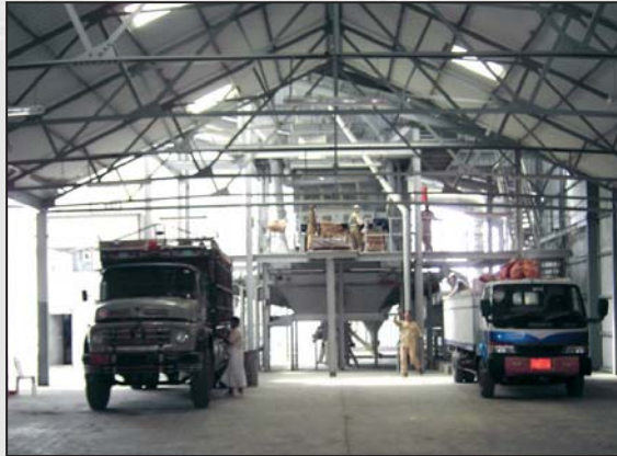
▲ Two movable truck loaders for the bags guarantee a loading without waste of time.