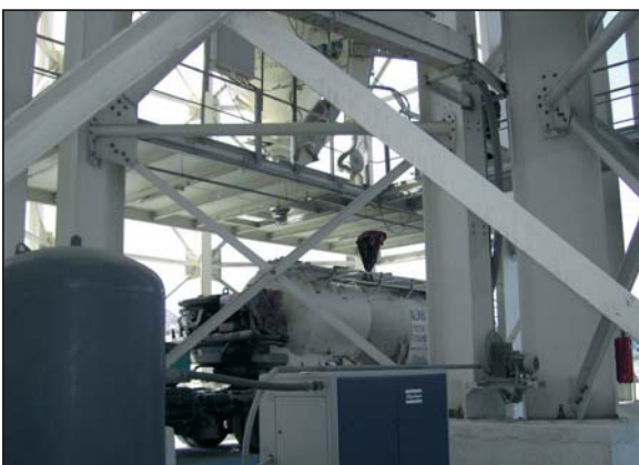
▲ Two silos equipped with jet loaders for bulk truck loading. All silos with safety equipments like overfill protections, level indicators, overpressure/vacuum flaps, dust filters and overflow pipes from silo to silo.